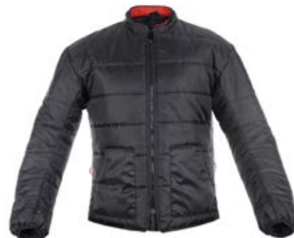
Removalbe winter lining