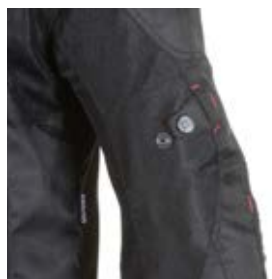
Adjustable upper arm