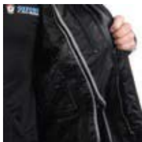
Removable thermal liner