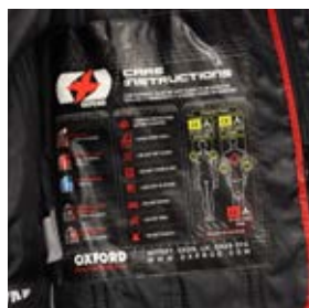
Care instructions on removable thermal liner