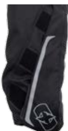
Leg adjustable system