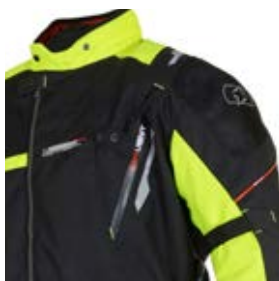
Reflective panel & piping