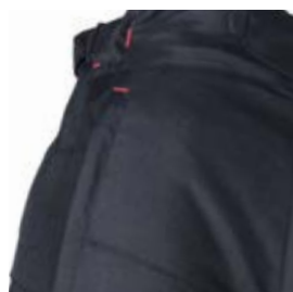
Adjustable waist strap