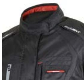
Synthetic suede collar lining with Neoprene for maximum comfort