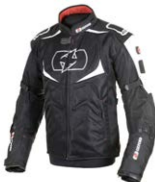
Melbourne 2.0 MS AIR Jacket Black/Red