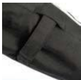
Arm width adjusters