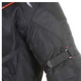
Adjustable upper arm strap