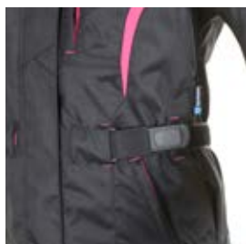
Adjustable waist strap