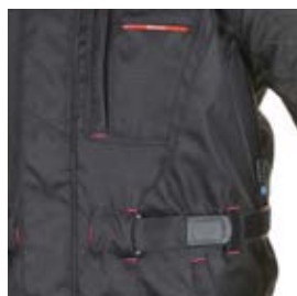
Adjustable waist strap